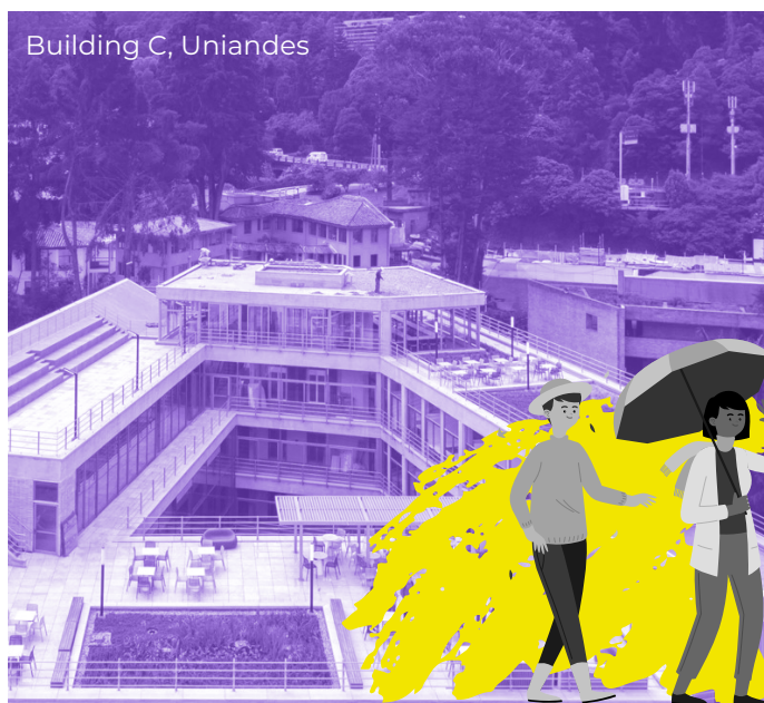
Building C, Uniandes