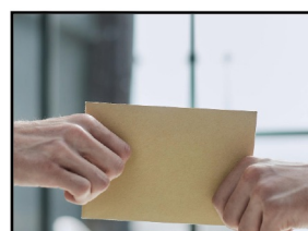
Recommendation Letter (Optional)