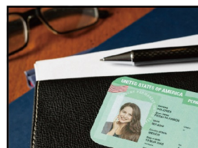
Photo ID Both Sides