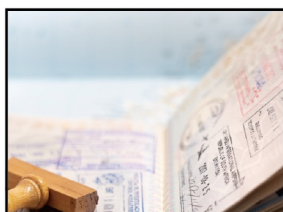
Passport's Info Page