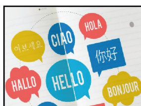
Chinese/English Proficiency Certificate