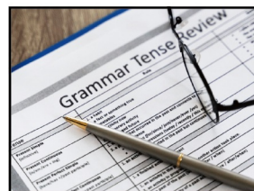
Latest official English transcript