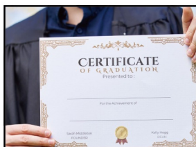
Home University Official Enrollment Certificate